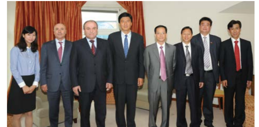
俄罗斯微车生产线项目 Mini car production line project in Russia

北方国际的工业与制造项目主要服务于大型工业设施、生产线、电信网络等的建设。NORINCO International undertakes industrial and manufacturing projects mainly including supply and construction of large industrial facilities, product lines, telecommunication network, etc.