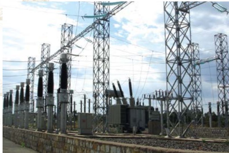
埃塞DBAM-1变电站 DBAM-1 Substation in Ethiopia 埃塞JBMT-2 变电站 JBMT-2 Substation in Ethiopia