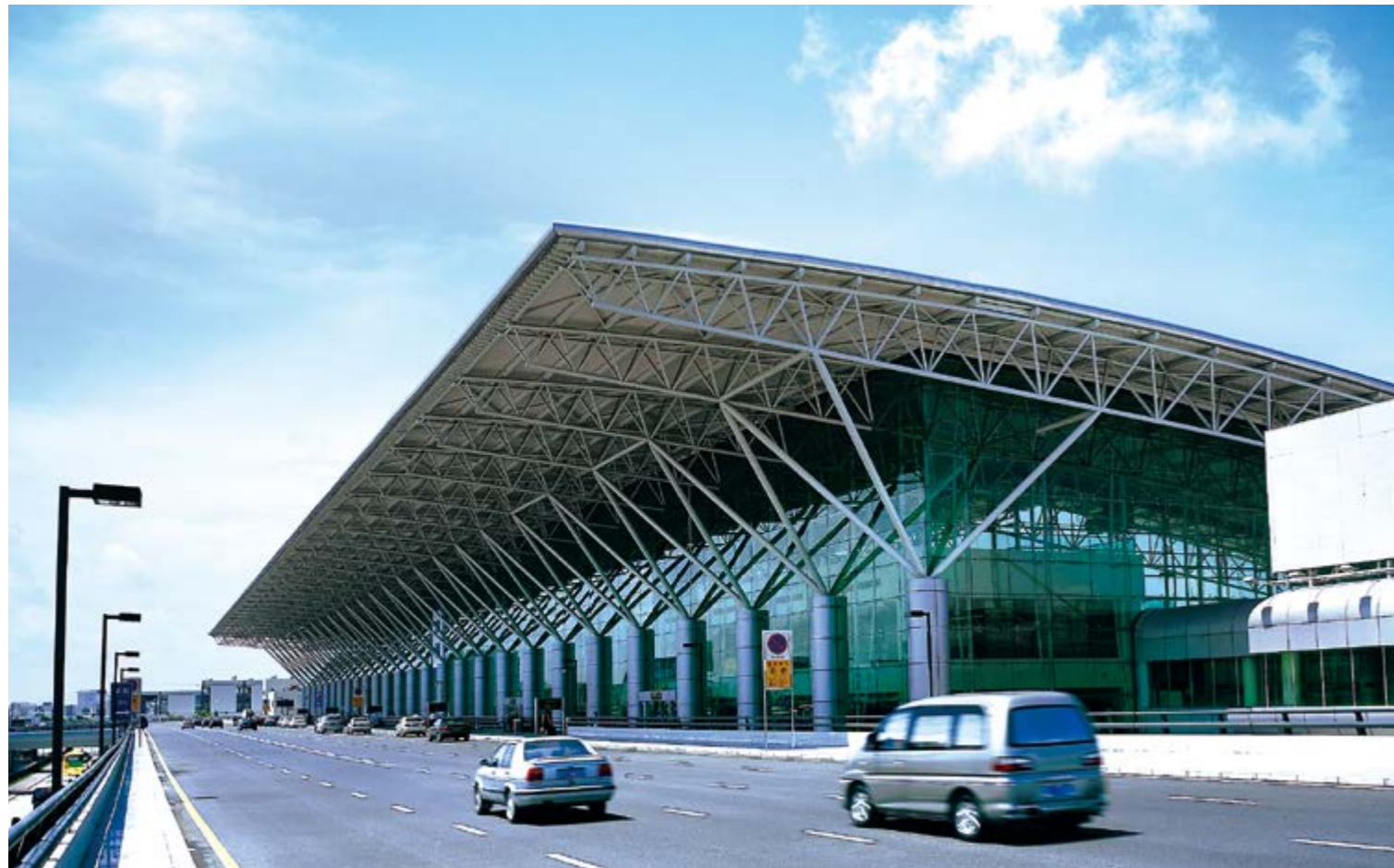
深圳宝安国际机场 Shenzhen International Airport