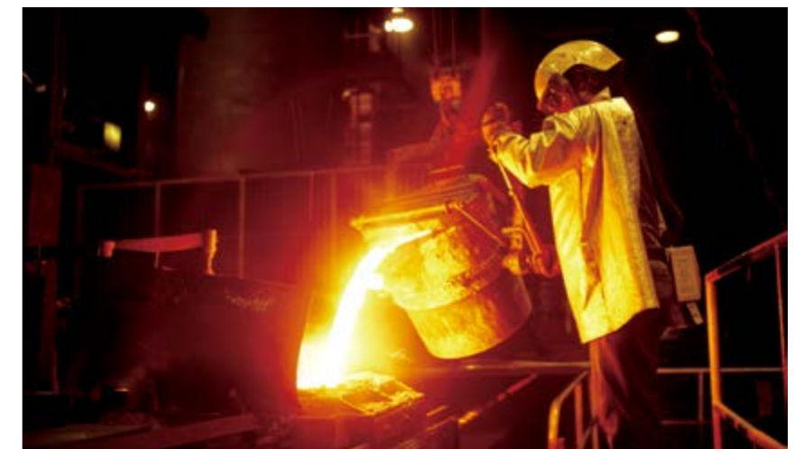
刚果金铜钴冶炼厂项目 Copper-cobalt smelter plant in D. R. Congo