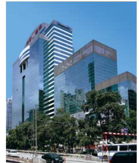
迪拜 GOLF TOWER