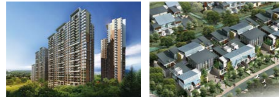
南沙境界 Nansha Realm Residence Project in Guangzhou 南沙境界鸟瞰 An aerial view of Nansha Realm Residence Project